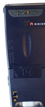
DMC 3000 Location Telemetry (LTx) Module