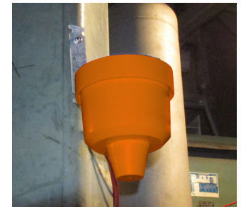
Anchor installed wall mount