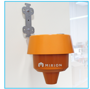
Anchor with wall mount with drip cover