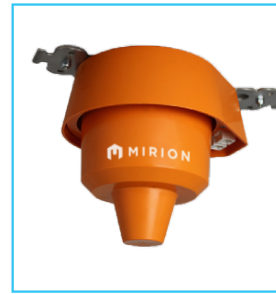
Anchor with overhead/ceiling mount with drip cover

An appropriately configured Orion Anchor network, can provide a location resolution of 1 m