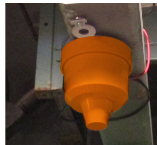
Anchor installed overhead/ceiling mount